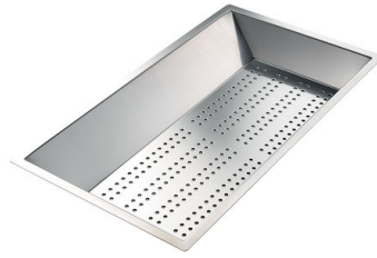
Stainless steel perforated tray